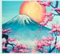
3/7 Mt. Fuji