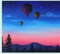
1/18 Up, Up and Away

Enjoy some stress-free creativity! Sit back, socialize and sip to find your inner artist in this step-by-step guided paint class. No experience necessary.