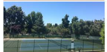
Miller Park Tennis Courts 8480 Sunset Ave. Courts: 8