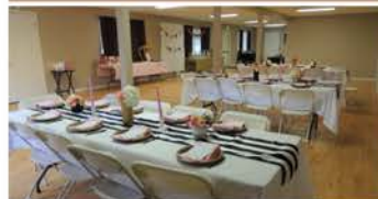
McMillan Center 11549 Fair Oaks Blvd. Capacity: 50-150