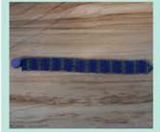
2/3 Peyote Stitch