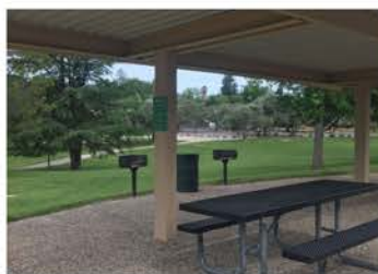
Miller Park Picnic Area 8480 Sunset Ave. Capacity: 20