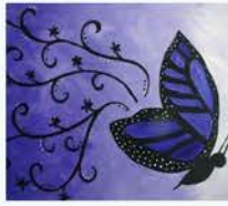
2/24 Blue Butterfly