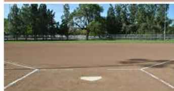
Fair Oaks Softball Fields 11549 Fair Oaks Blvd. Fields: 2