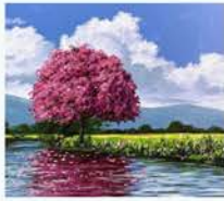
4/27 In the Meadow