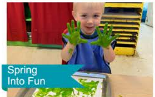
Spring Into Fun

Calling all toddlers and preschoolers! Join us for fun with your little one. Themed crafts, activities, play, and exploration will be provided. All children must be accompanied by an adult. Children under 18 months allowed with additional registered child.