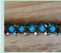
2/17 Right Angel Weave