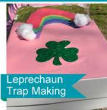
Leprechaun Trap Making

Let's get creative! Join FORPD staff for a kid's hands-on DIY series. Create holiday-themed sweets, treats and/or crafts.