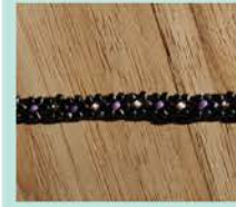
1/27 Daisy Chain Stitch

Learn various bead weaving skills to bump up your jewelry making skills.