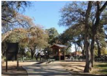
Fair Oaks Park BBQ Area 11549 Fair Oaks Blvd. Capacity: 200