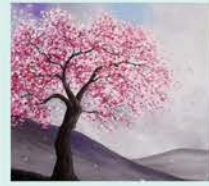
2/8 Sweet Cherry Tree