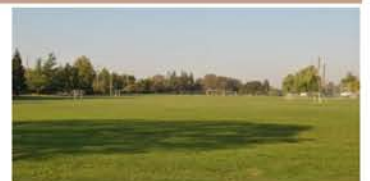
Multipurpose Fields Locations Vary Fields: Varies by Location