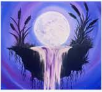
1/27 Mystic Falls

Let's get creative! Have fun and connect with your family during this step-by-step guided painting class. No experience necessary.