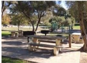
Miller Park BBQ Area 8480 Sunset Ave. Capacity: 45