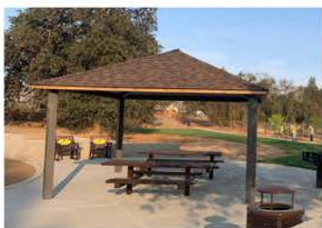
Gum Ranch Picnic Areas 5600 Tuckeroo Way Capacity: 30