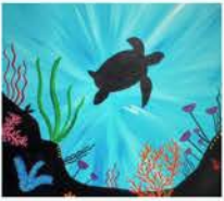
3/23 Under the Sea